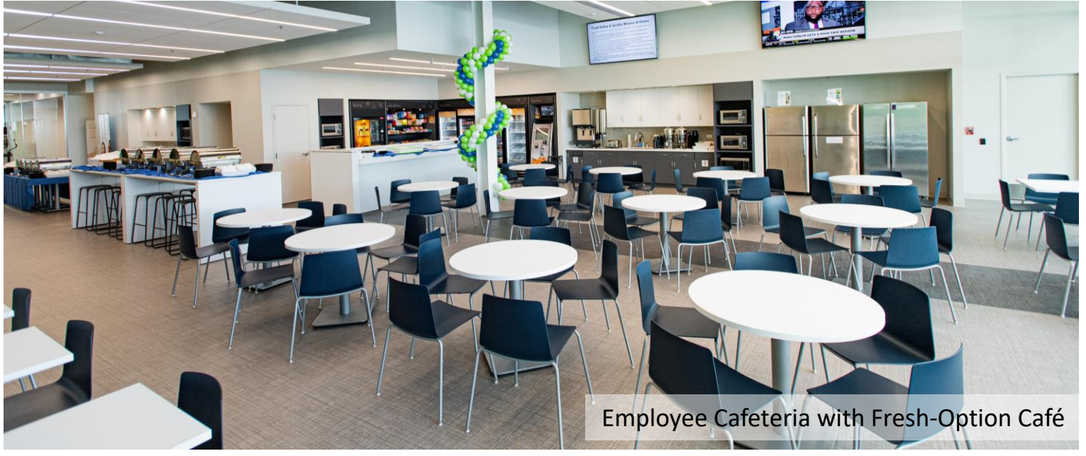
Employee Cafeteria with Fresh-Option Café