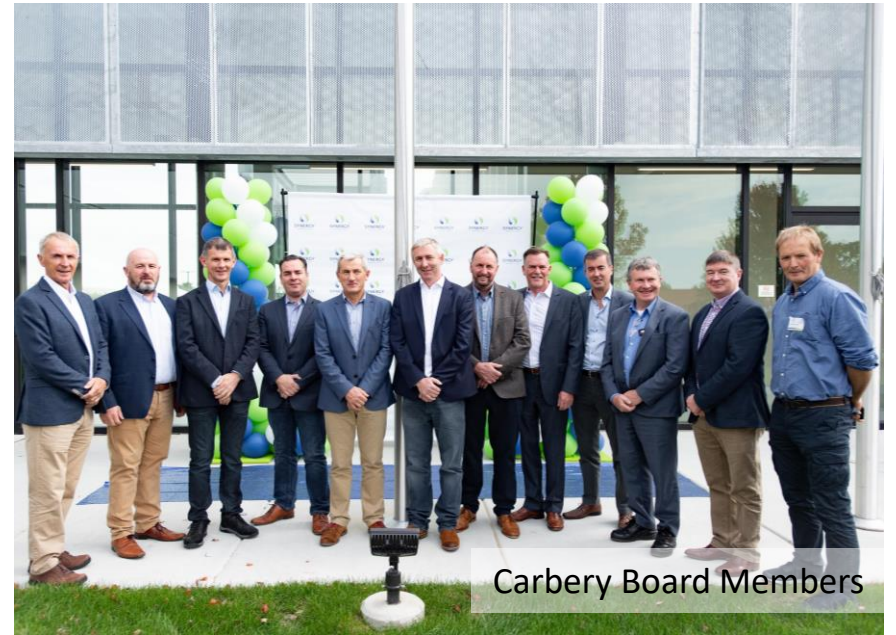
Carbery Board Members

“Sustainability is at the forefront of what we do; and our expanded campus highlights two key aspects of that - first, bringing to life our vision to create a mutually beneficial environment for all those involved and second, focusing on the environment, which was accomplished through our LEED (Leadership in Engineering and Environmental Design) Gold certification on the project. The completion of this phase of our expansion project is an important milestone for Synergy Flavors, adding open, naturally-lit workspaces for our employees, as well as enhancing the on-site experience for customers and vendors.”