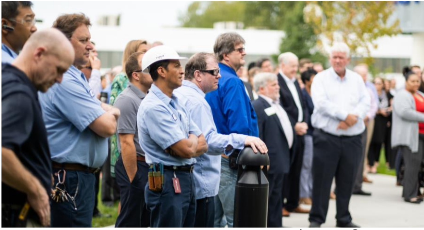
Synergy Employees & Guests